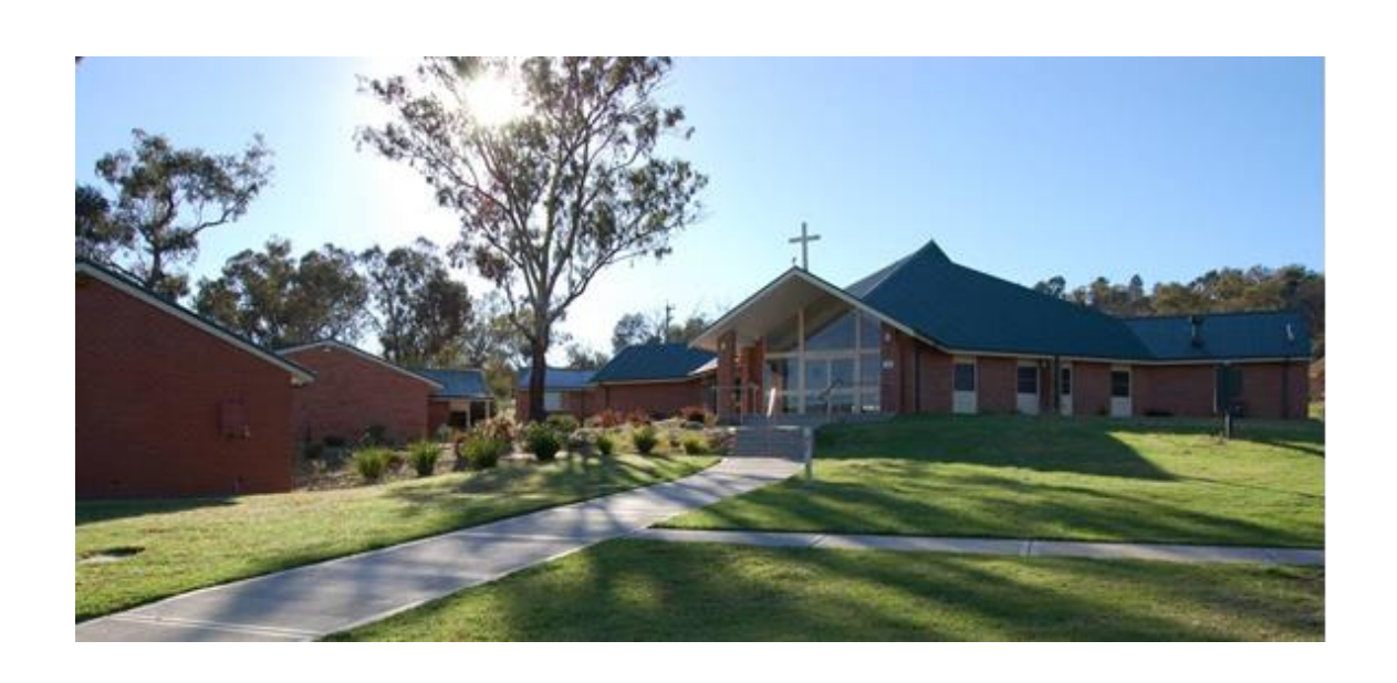
St Martin's College